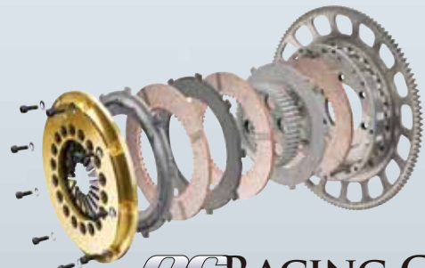
OS RACING CLUTCH